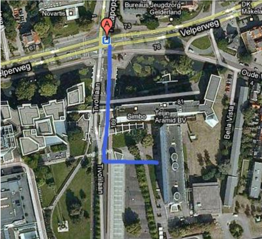
Figure 5: Walk from "Raapopseweg" bus stop to Microflown