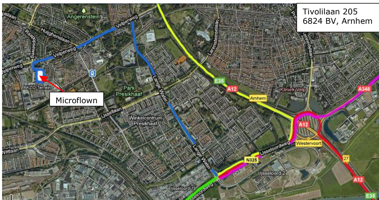
Figure 2: Map to Microflown

Drive straight on crossing four traffic light till the end of "Lange Water". After crossing the railroad at the next traffic light take a left on the "Velperweg". After about 1km at the second traffic light take a left on the "Tivolilaan" On the leftside you will see the building "De Enk" on which Microflown is located on the 3 rd floor.