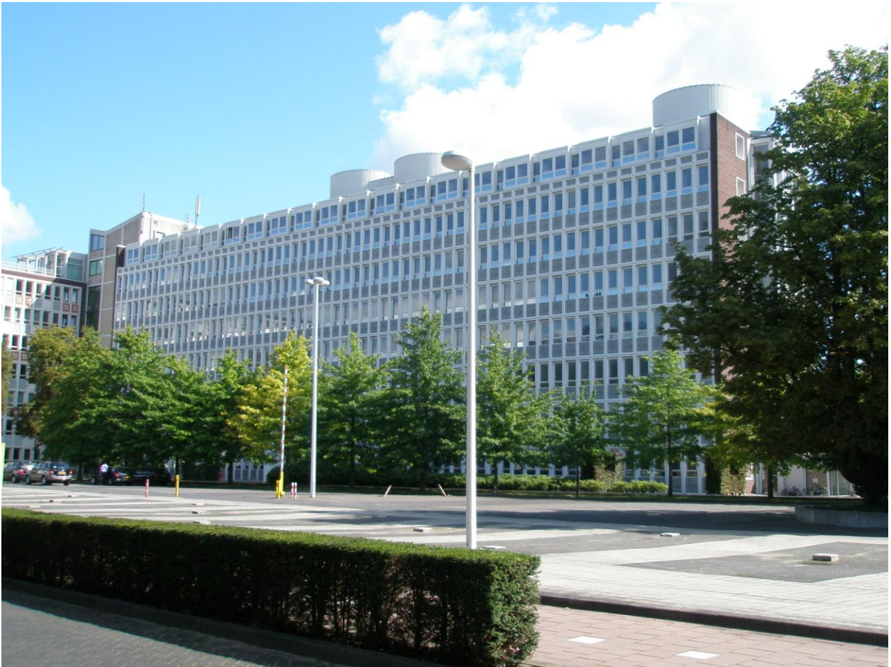
Figure 1: Building "De Enk" where Microflown is located on the 3 rd floor of the building

Tivolilaan 205, 6824 BV Arnhem / Floor 3