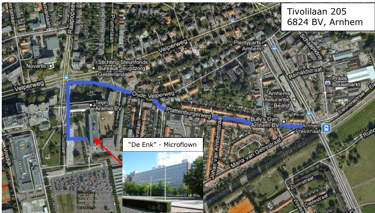
Figure 4: Walk from trainstation Arnhem Presikhaaf to Microflow